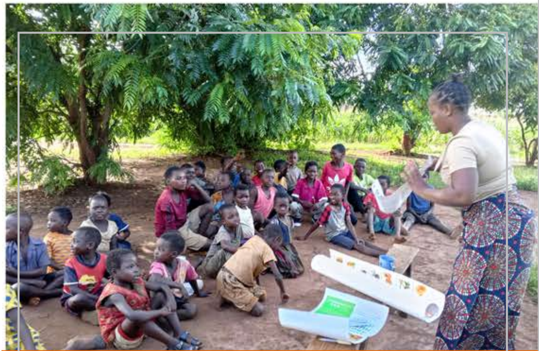
Phase 1: Bitter - Land and Minds preparedness

Our first set of lessons, called "Bitter: Land and Mind Preparedness," is off to a great start. Participants are learning about how agriculture and nutrition are connected and how taking care of the land is linked to their health.